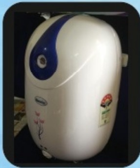
15 or 25 Liters Storage Geyser ABS Body / Gloss Line Tank Available