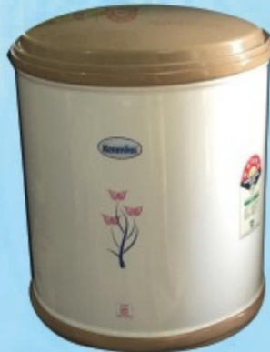
25 Liters Storage Geyser Metal Body