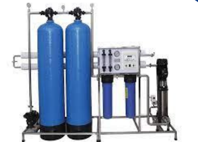
Reverse Osmosis (RO) Plant