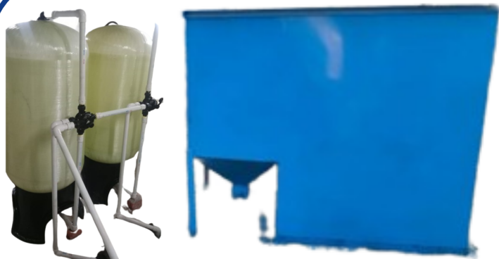
STP (Sewage Treatment Plant) ETP (Effluent Treatment Plant)