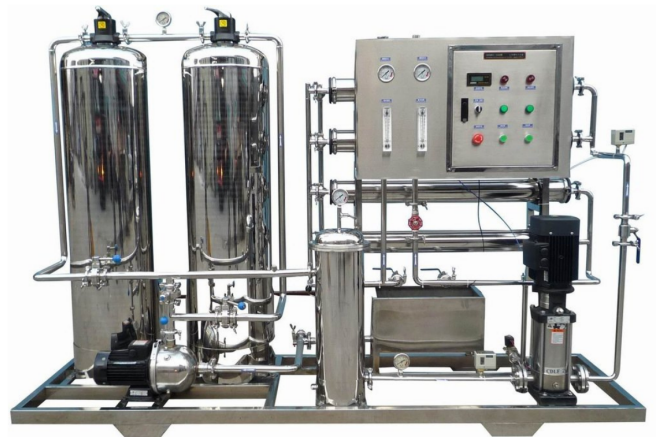
Stainless Steel RO Plant